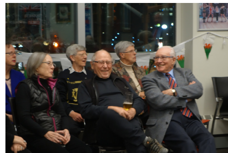
Above and below: OWS members and guests at the British High Commission for the celebration of Dylan Thomas.