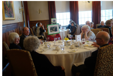
OWS members at the Royal Ottawa Golf Club for the St. David's Day luncheon.